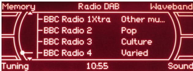
Sample list of available radio stations

After scan process finish, system shows list of available radio services fig.5 . To select next or previous service use main knob of MMI2G system or buttons under the knob.